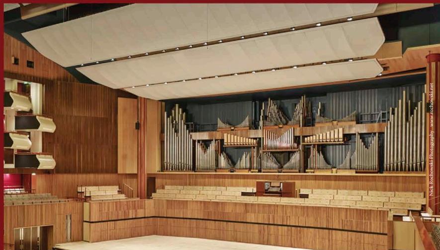
The Royal Festival Hall, London